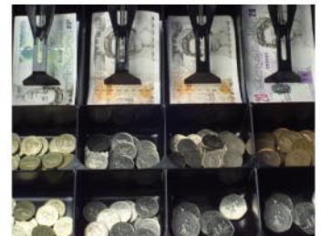
The cash drawer has four notes and eight coin compartments