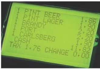
8 line, 20 character scrolling display