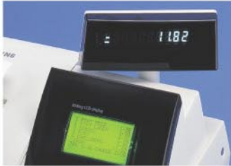
The user can rotate the LCD display for high visibility