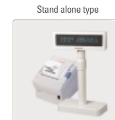
Stand alone type