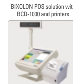
BIXOLON POS solution with BCD-1000 and printers