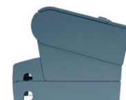
Power supply case fits under printer without increasing footprint size.