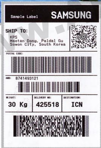
Variable barcode types available (1D/2D)