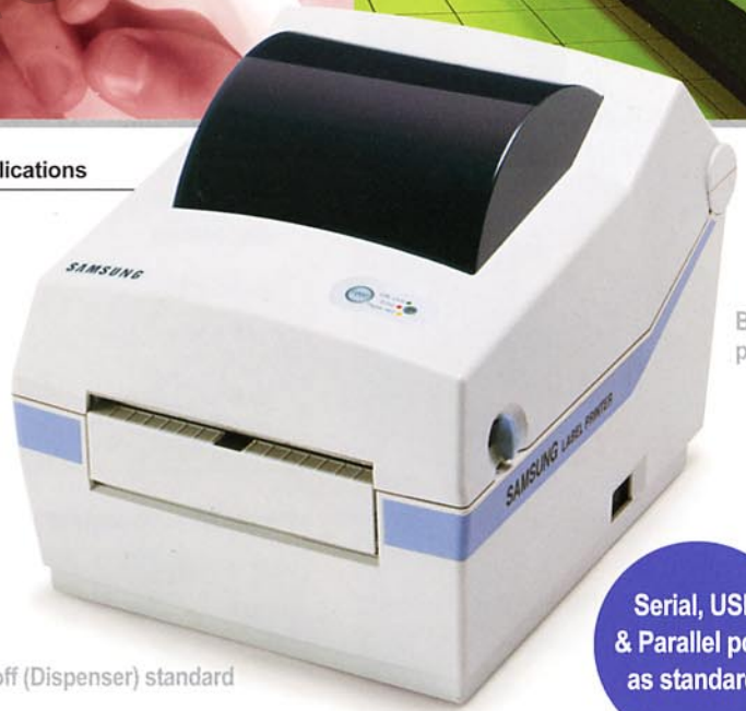
Back side paper loading