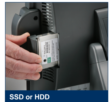
SSD or HDD