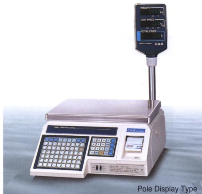
Pole Display Type

Specifications are subject to change for improvement without prior notice.